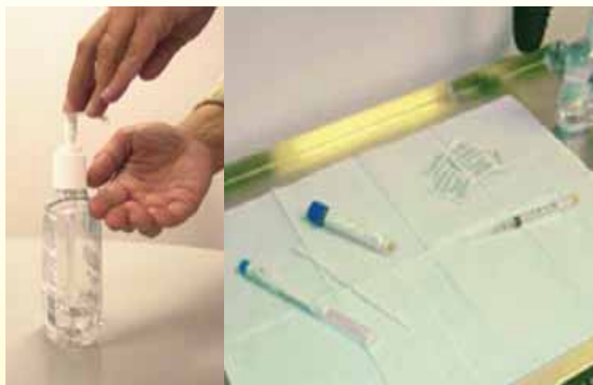
Infection Control & Immunization are both important to your health.