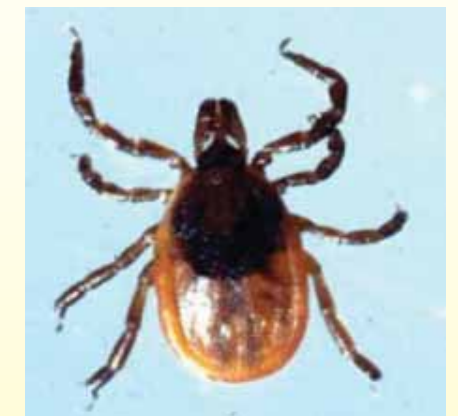
An adult female black-legged tick magnified to 100x its size.