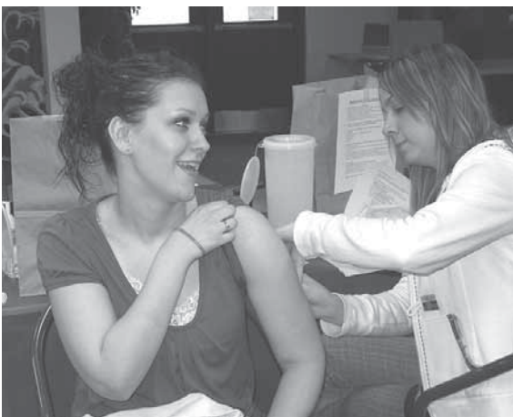
Mumps shot at Health Unit Clinic in St. Lawrence College, Brockville, March 2009.